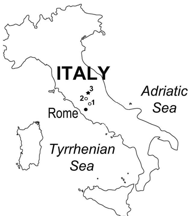
Fig. 1 - Location map of the three localities discussed in the text. 1, Castel San Pietro (Rieti, Latium); 2, Nera Montoro (Terni, Umbria); 3, Spoleto (Perugia, Umbria).